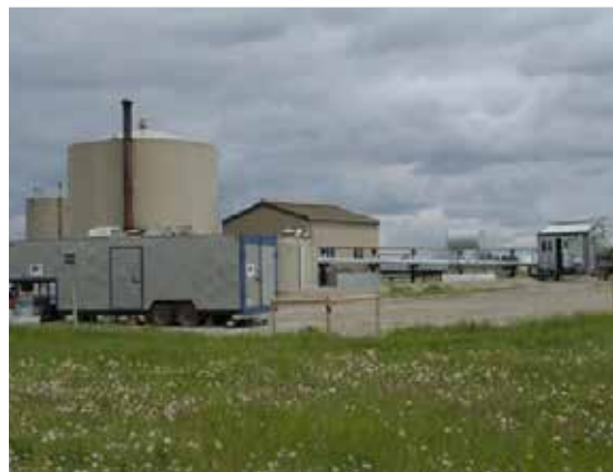
Photo: NEXEN Plover Pilot Plant for solvent injection.

Husky Energy has moved on to commercial deployment of CO 2 solvent injection at its Edam, Mervin and Lashburn operations, with injected carbon dioxide captured from its nearby Lloydminster upgrader.